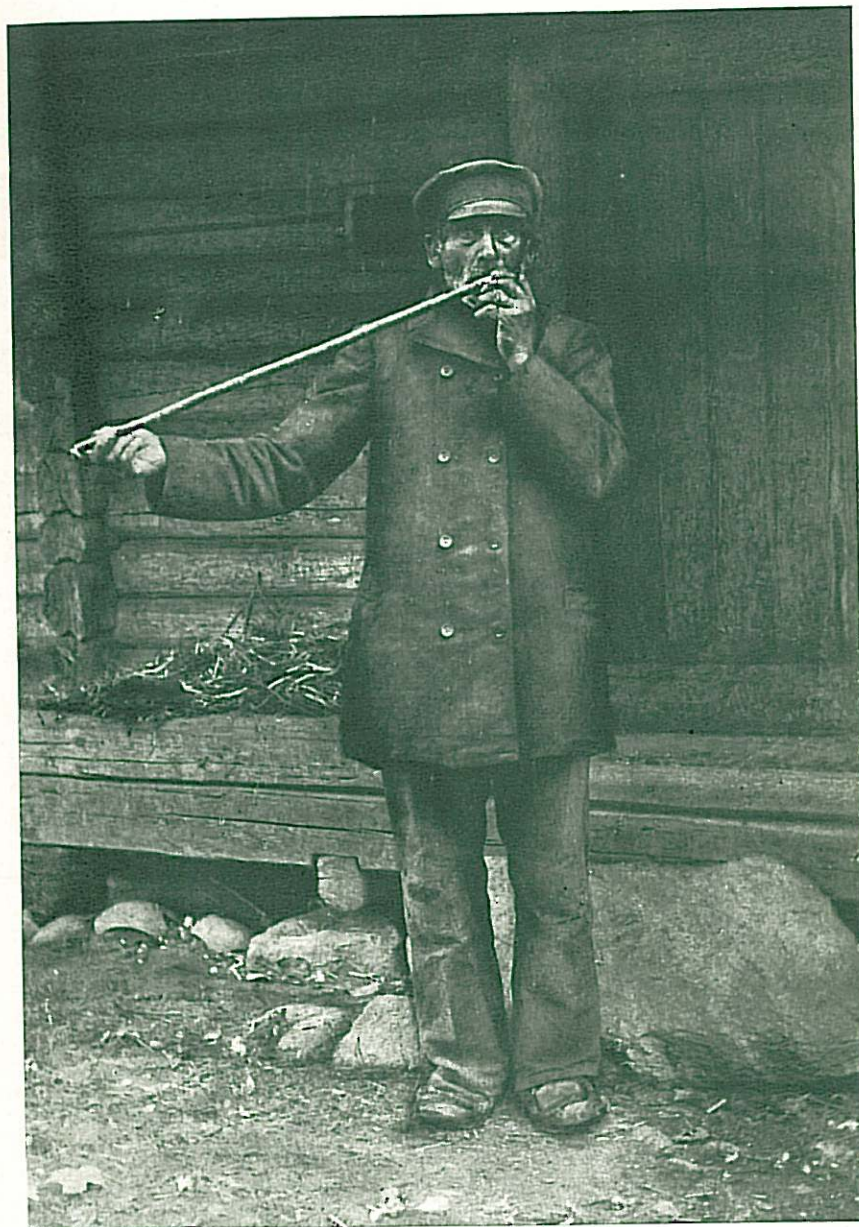
Stanislovas Valackas (1834—1926) su švilpa apie 1907 m.